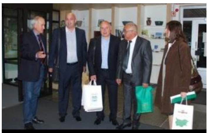
The group of visiting mayors.

From the 17th to the 21st of September 2013 the Mayors of the municipalities of Karnobat, Malko Tarnovo and Varshets have visited (3000 the of Trysil town inhabitants), situated 250 km north from Oslo. The visit was following an invitation of the Mayor of the municipality Mr. Ole Martin and was financed by the Bilateral Fund at National Level. The visit began with an introduction to the activities of the Trysil Municipality followed by a presentation of an energy efficiency implemented bv two project partners - on the one side the regional council of South Osterdal, through which are represented 5 municipalities - Elverum, Engerdal, Stor-Elvdal, Trysil and Amot and the other is the regional council of Hedmark. Its main goals are to provide technical assistance for the municipalities and the regional council with the aim of reaching 25% of energy efficiency in all municipal buildings till the end of the project in 2015.